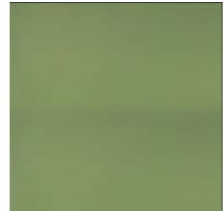
Light Patina RAL 6021