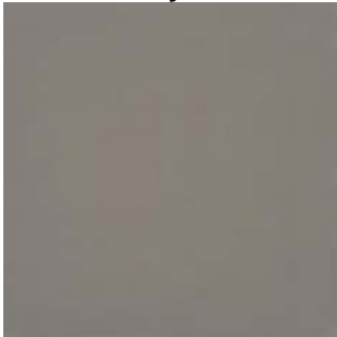
Medium Grey RAL 7030