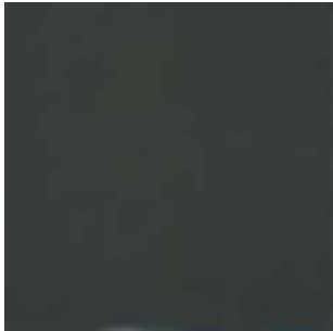
Traffic Grey RAL 7043