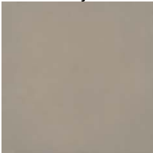
Light Grey RAL 7032