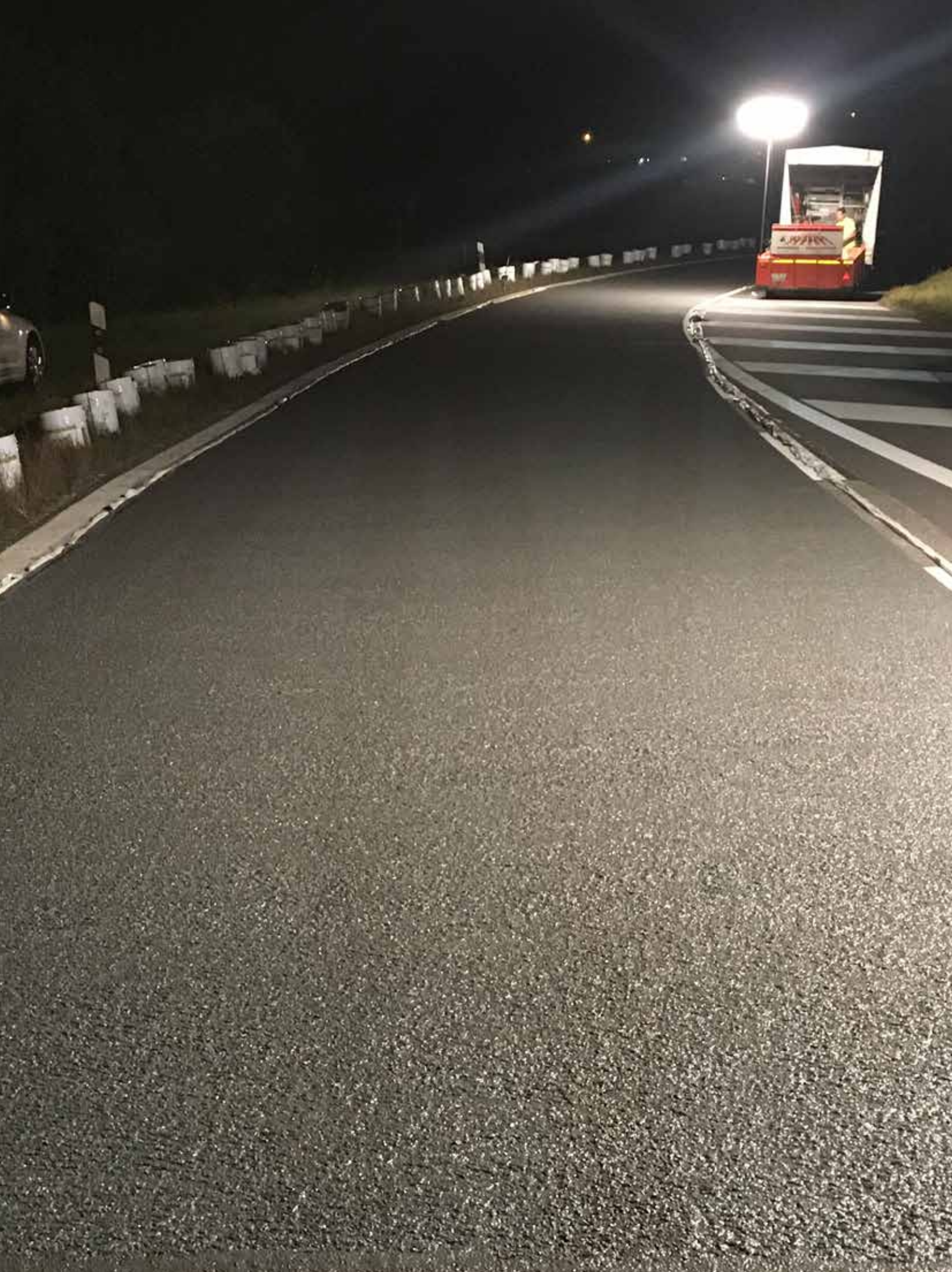
WeTraffic | Motorway entry, Crissier VD