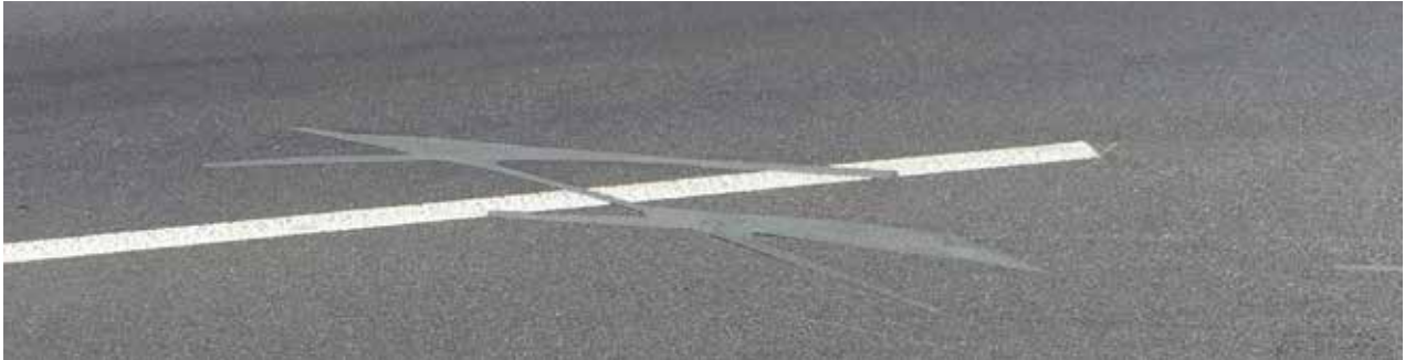
WeTraffic - Repair Mortar, coarse, and WeTraffic Repair Mortar, fine