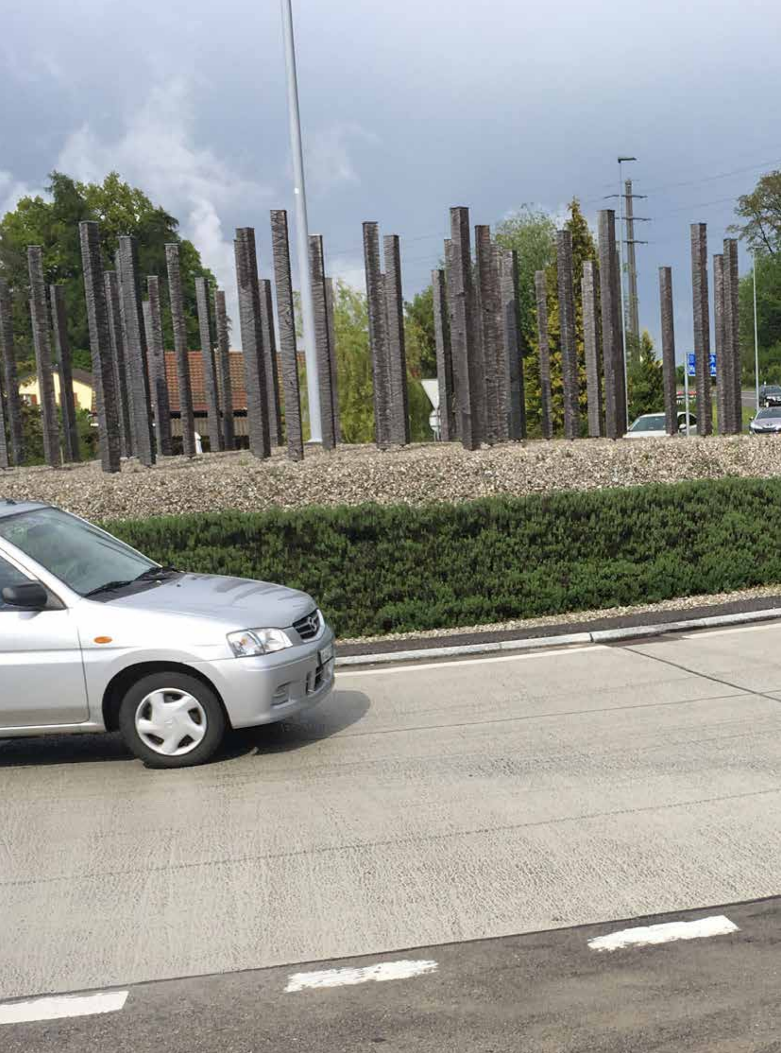
WeTraffic | Spittel Roundabout, Suhr AG