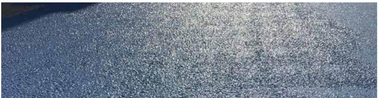
WeTraffic - Textured Surfacing High Performance