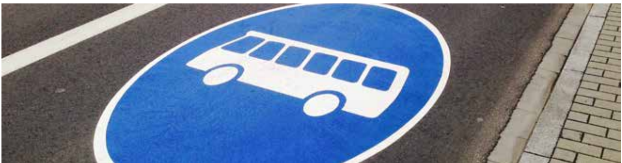
WeTraffic - Textured Surfacing FGS0